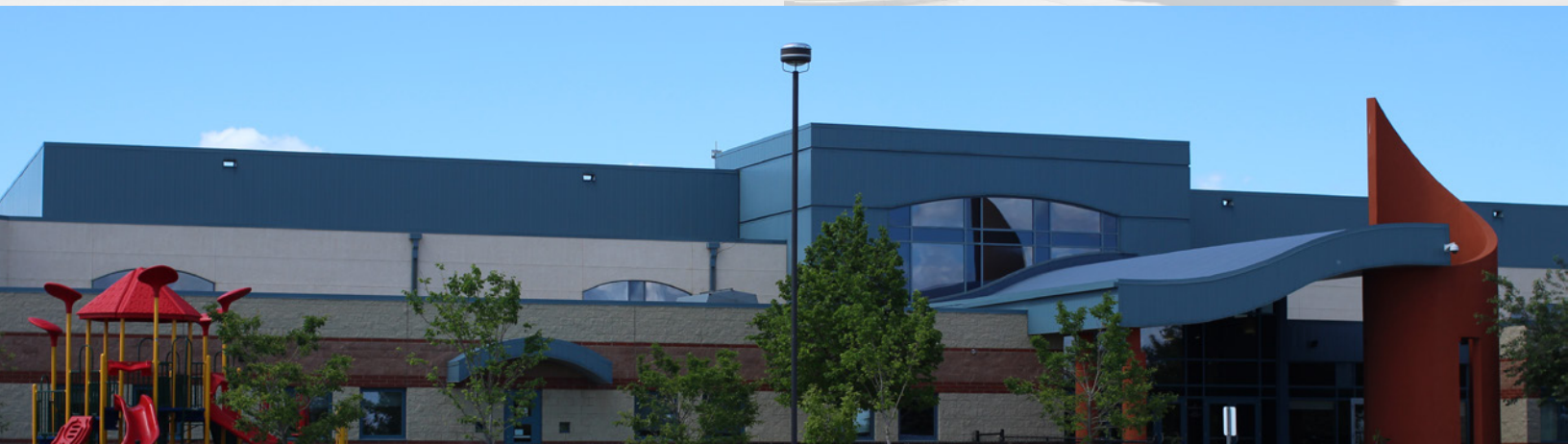
595 LAGIMODIERE BLVD