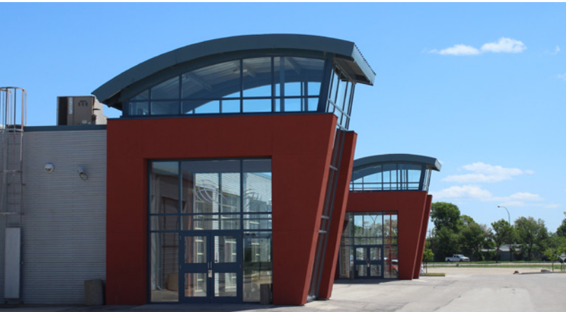
725 LAGIMODIERE BLVD

Our Springs Inner City campus is located at 648 Burrows Ave. Throughout the week we host many different services and events that people from our inner city can join us for. Through our Sunday Services, kids classes, Friday night kids programs, Friday night youth, Food Bank, Breakfast and a Movie and many more we know that God is impacting our inner city in a huge way!